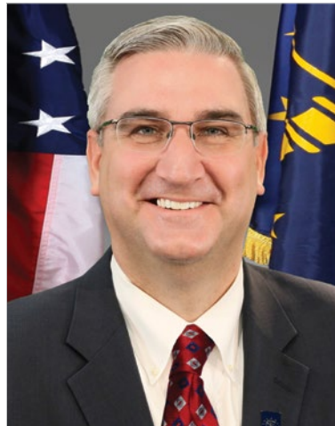
Eric J. Holcomb